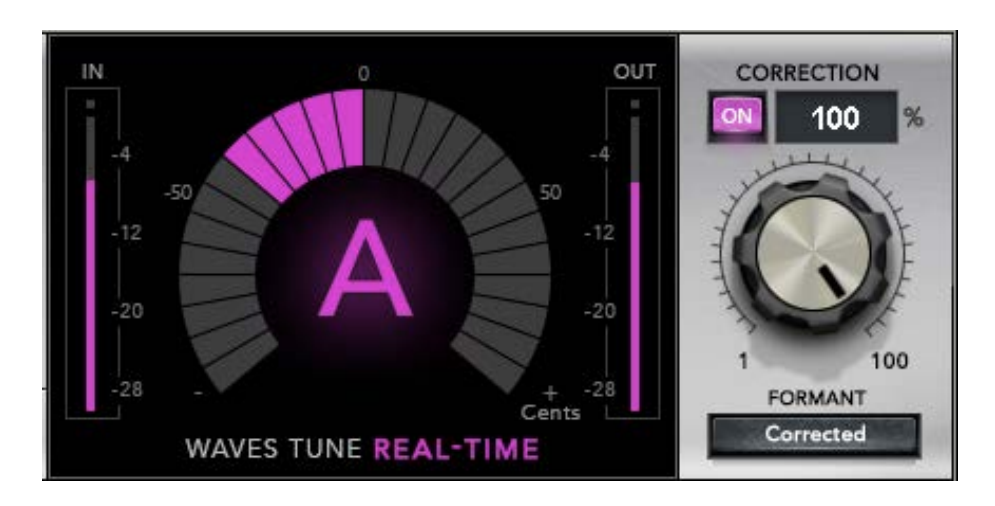
Example 1: Correction knob is set to 100%. The meter shows 40 cents pitch down.

The Pitch Correction Section controls the amount of corrected signal that will be added to the original sound. The target note and the amount of correction applied are indicated by the Correction meter. In the two examples below, vocal pitch is 40 cents above A.